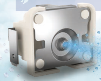
nanoe™ X device

Unique nanoe™ X module casing releases 48 trillion hydroxyl radical (OH radical) per second.