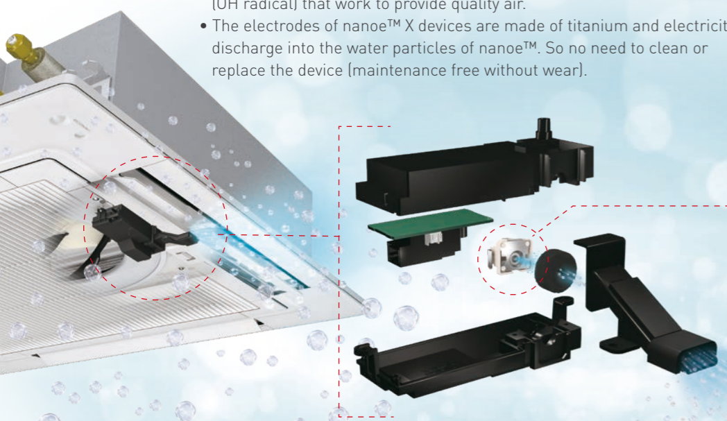
nanoe™ X module

Electrodes of nanoe™ X devices are produced with the support of craftsmen in Japan that has advanced expertise on processing ultra-small parts of titanium glass frames although titanium is very strong material and difficult to process.