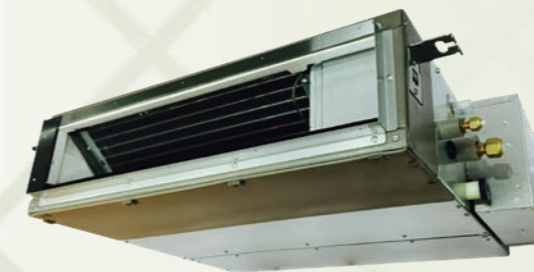
S-22MM1E5B / S-28MM1E5B / S-36MM1E5B S-45MM1E5B / S-56MM1E5B

The ultra slim M1 type is one of the leading products of its type in the industry. With a height of only 200 mm, it provides greater flexibility and adaptability for various applications. In addition, high efficiency and extreme low noise level make it highly suitable for hotels and small offices.