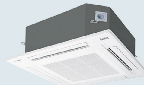
S-22PU225 Commercial Air Conditioner