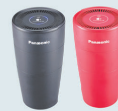
F-GPT01A nanoE™ X Generator