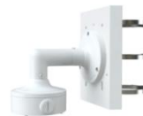
PM-YH0101B-W + PM-YZJ0406-W + PM-YZJ0501-W Pole mount bracket