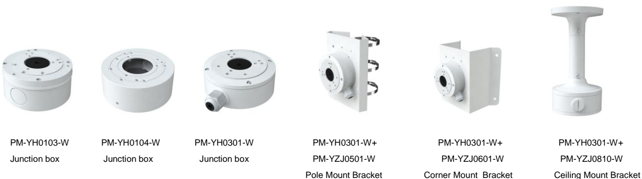
PM-YH0103-W Junction box