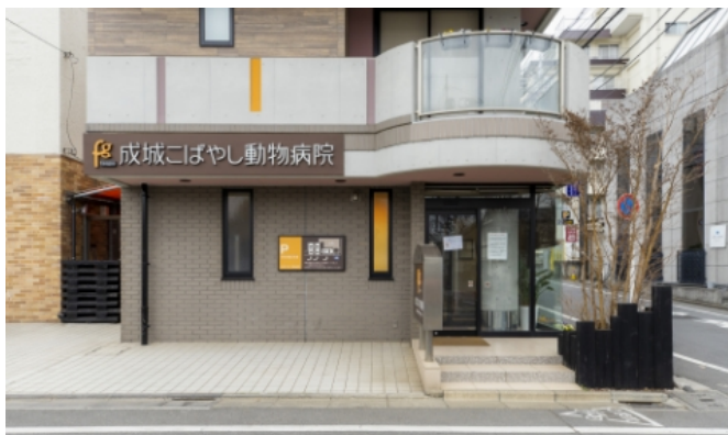
Seijo Kobayashi Veterinary Clinic

Seijo Kobayashi Veterinary Clinic follows the management philosophy of “fee-goo”, a popular contraction of the English phrase “feel good.” The clinic, which prides itself on showing a spirit of kindness to pets and their owners, offers a wide range of treatments and palliative care.