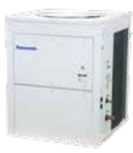
U-75PVY1H8 U-100PVY1H8 U-125PVY1H8